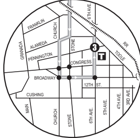
Southbound Downtown Detail (Detalle del Centro hacia el Sur)