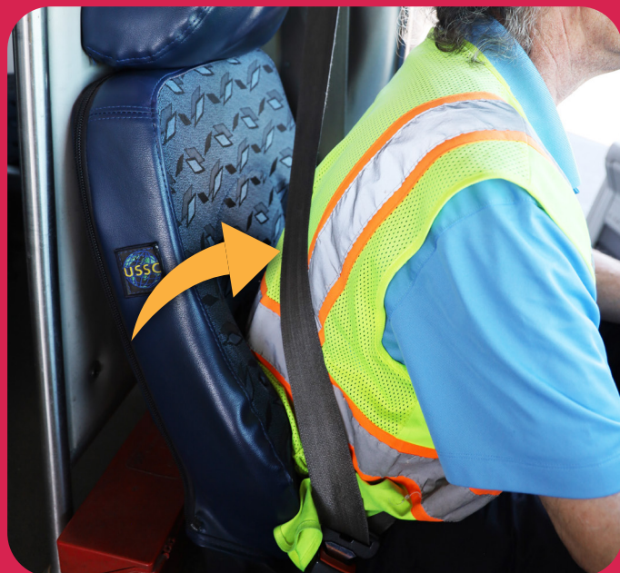
Shoulder belt behind body