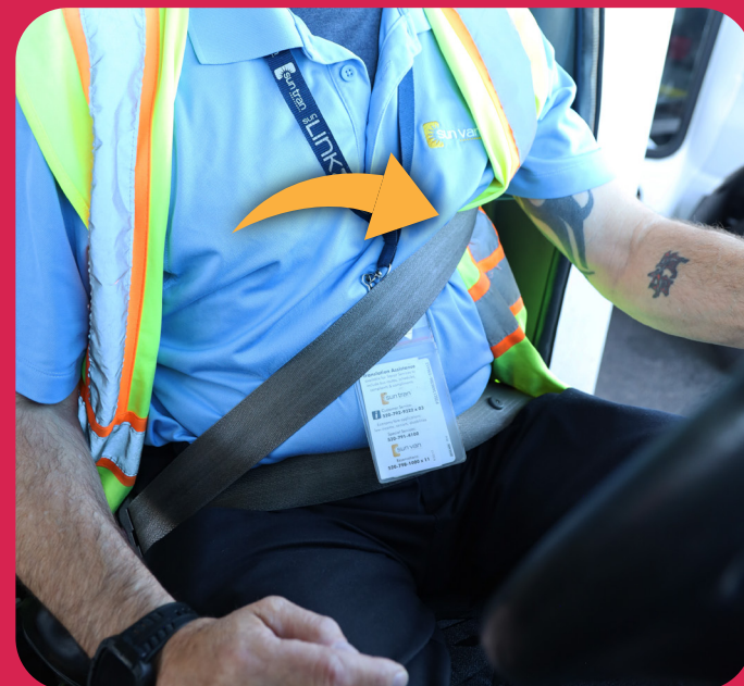
Shoulder belt under arm