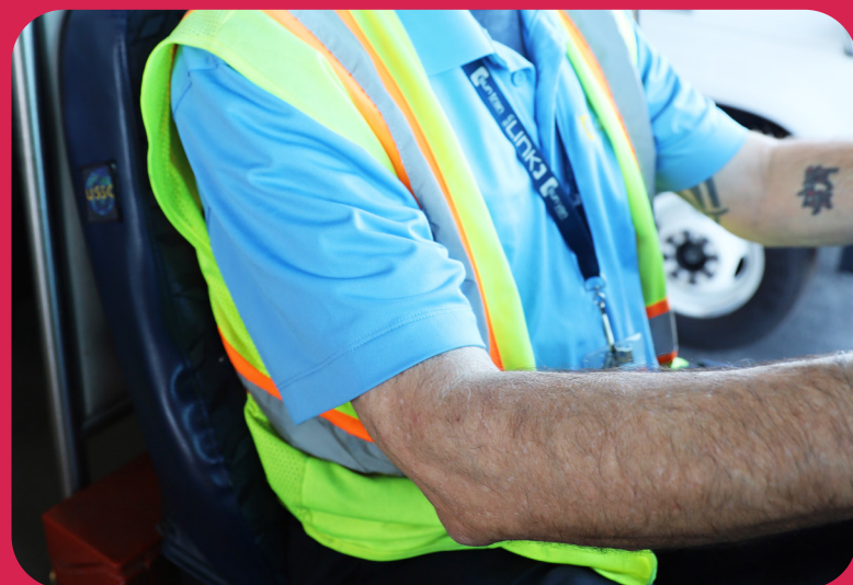
Not wear it at all