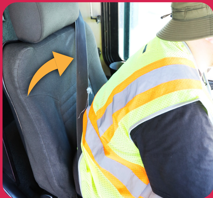
Shoulder belt behind body